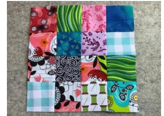
Patchwork block example

SASHING/POSTS/BORDERS: There will be simple 2 ½" wide (unfinished) sashing between the blocks and rows. There will be 2 ½" x 2 ½" (unfinished) sashing posts between the blocks/rows as well. There will be a simple 2 ½" wide (unfinished) border.