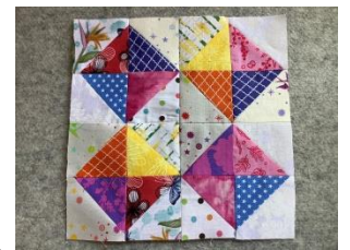
HST block design example

FABRICS: This pattern is designed to use your stash – use any combination of scraps, leftover precuts, fat quarters and/or yardage. Jelly roll (2 ½") strips could be used for a quick and easy strip-pieced version of block #1 while a variety of fat quarters would work well for blocks #2 - #7. See Fabric Requirements below for details. Fabric labels are included below to print out for your personal use only.